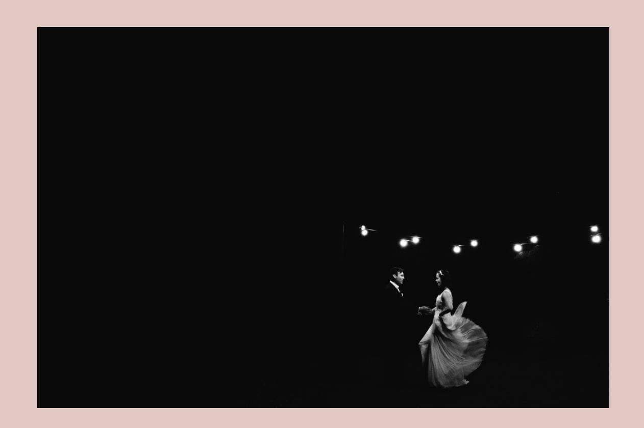
Those who don't believe in magic will never find it - Roald Dahl