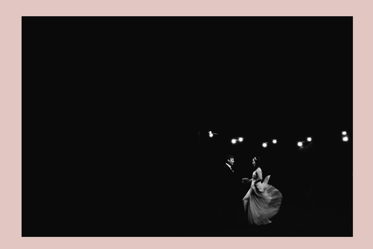
Those who don't believe in magic will never find it - Roald Dahl